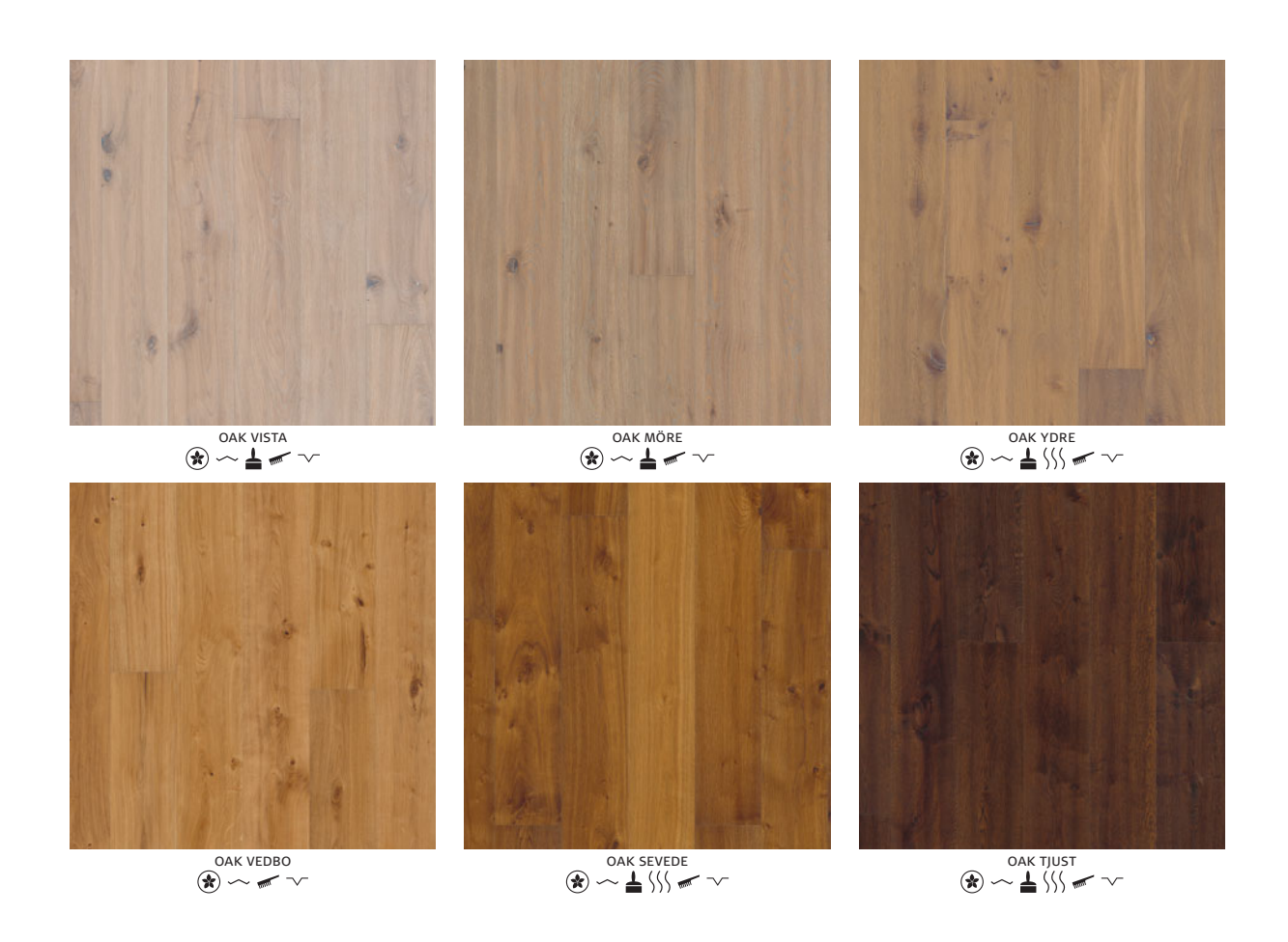
SIZE: 2420x187x15 mm. JOINT: Woodloc® 5s. Surface: Linseed oil. Guarantee: 30 years.