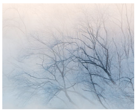
VISTA Misty whites with balanced contrast and transparency.