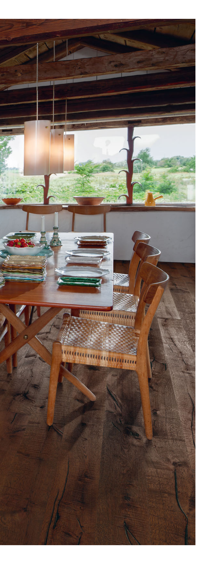
TVETA Dark soil with grimy flashes on an underlaying warm glow.